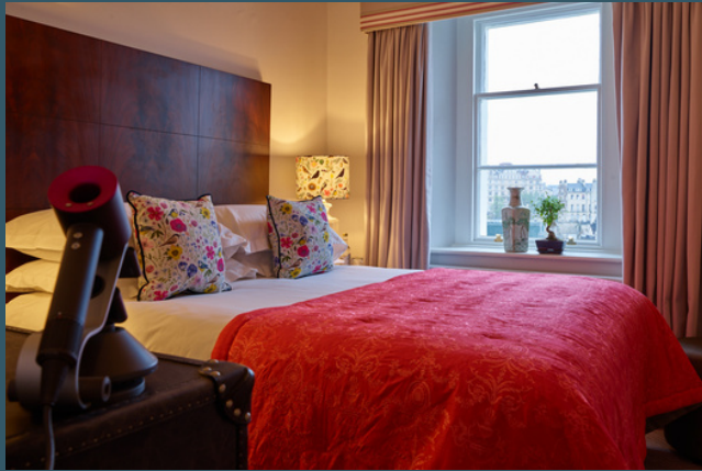
COMFY LUXE ROOM