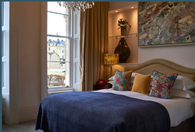
SPLENDID LUXE ROOM